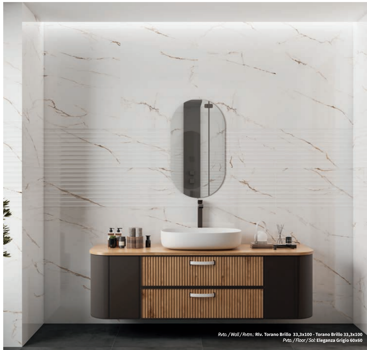
Rvto. / Wall / Rvtrm.: Rlv. Torano Brillo 33,3x100 - Torano Brillo 33,3x100 Pvto. / Floor / Sol: Eleganza Grigio 60x60