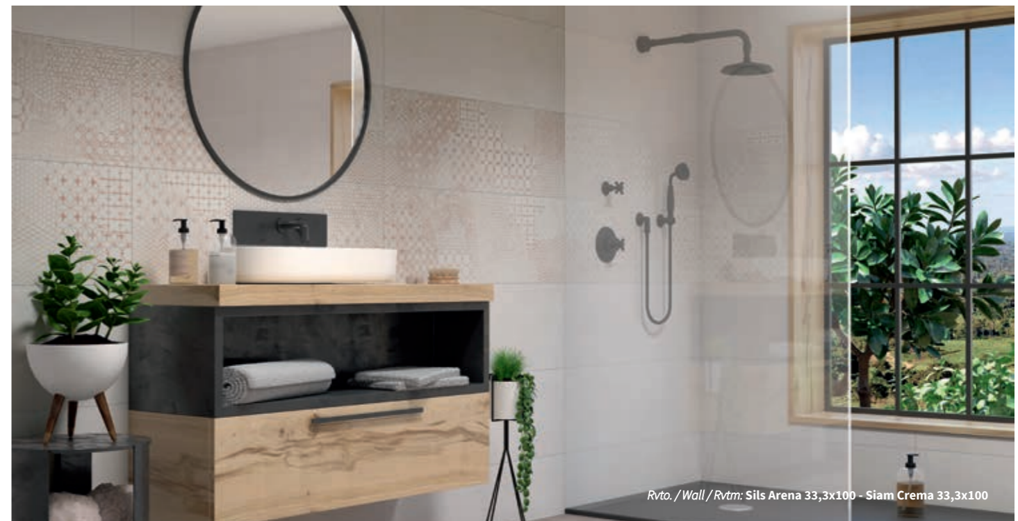
Rvto. / Wall / Rvtm: Sils Arena 33,3x100 - Siam Crema 33,3x100