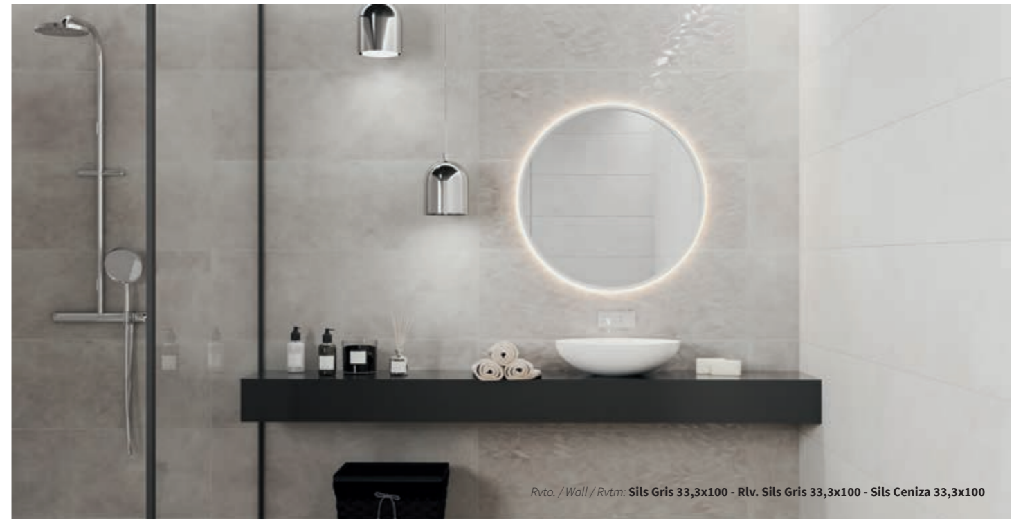
Rvto. / Wall / Rvtm: Sils Gris 33,3x100 - Rlv. Sils Gris 33,3x100 - Sils Ceniza 33,3x100