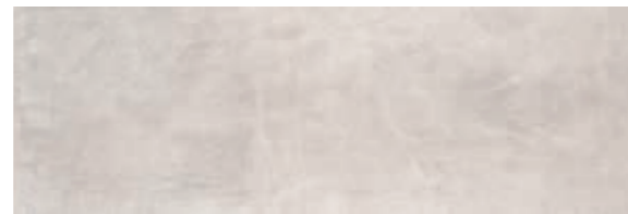
Sils Ceniza ● 33,3x100 Rec. M64 031.627.0019.02568