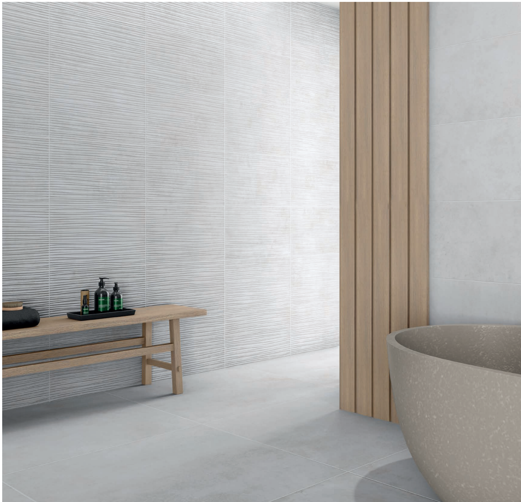
Rvto. / Wall / Rvtn: Civis Perla 33,3x55 - Rlv.Civis Perla 33,3x55 Pvto. / Floor / Sol: Civis Perla 90x90