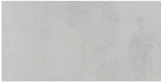
At. Civis Perla PEI 4

GRES PORCELÁNICO ESMALTADO GLAZED PORCELAIN TILES · GRÉS CÉRAMÉ ÉMAILLÉ