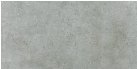
At. Civis Ceniza PEI 4