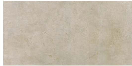
At. Civis Beige PEI 4