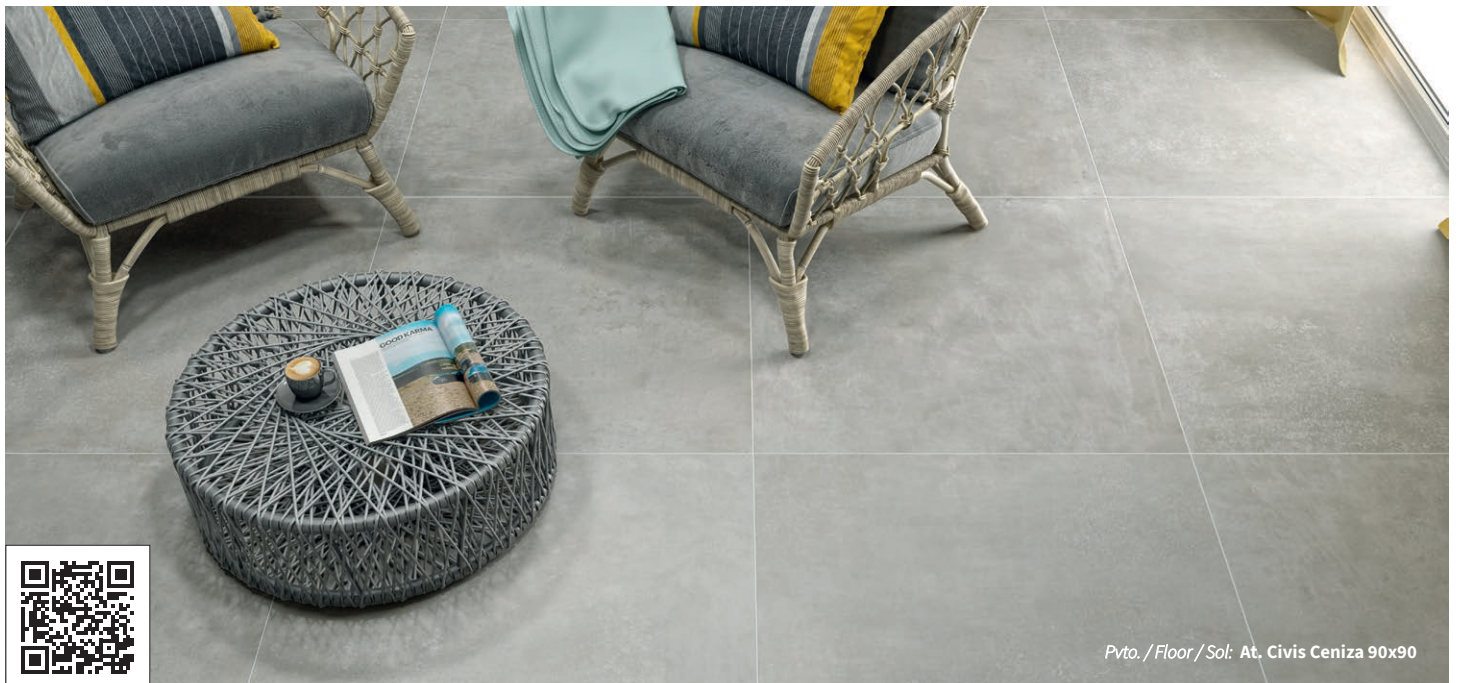
Pvto. / Floor / Sol: At. Civis Ceniza 90x90