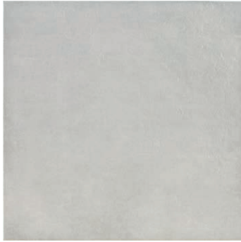
At. Trent Perla PEI 4

GRES PORCELÁNICO ESMALTADO GLAZED PORCELAIN TILES · GRÈS CÉRAME ÉMAILLÉ