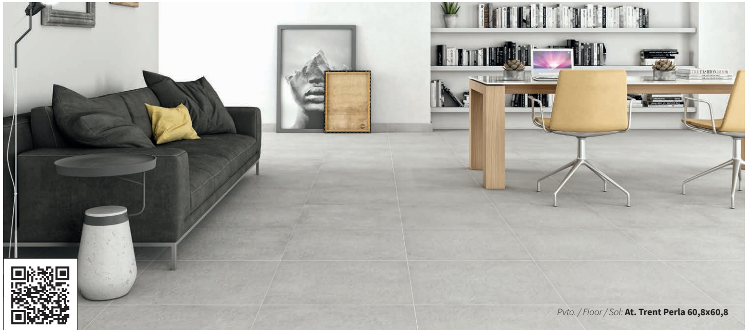
Pvto. / Floor / Sol: At. Trent Perla 60,8x60,8