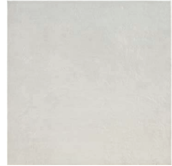
At. Trent Nacar PEI 4