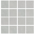
Malla At. Trent 30x30(7)