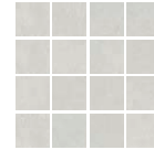
Malla At. Trent 30x30(7)