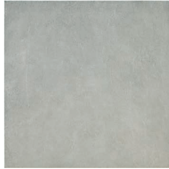
At. Trent Gris PEI 4